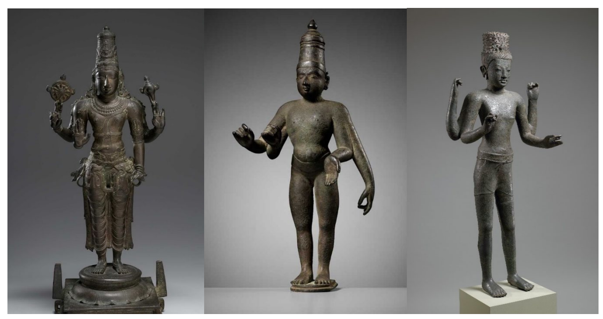
Fig 4. Lot 243 positioned between bronzes from Tamil Nadu and Thailand

Depiction in this form would have maintained a relatable quality to the bronze that is so often not seen in other more elaborate castings of the Chola and Vijayanagar periods, reminding the faithful of this new territory that they are looking at a god very similar to what they are already familiar with.