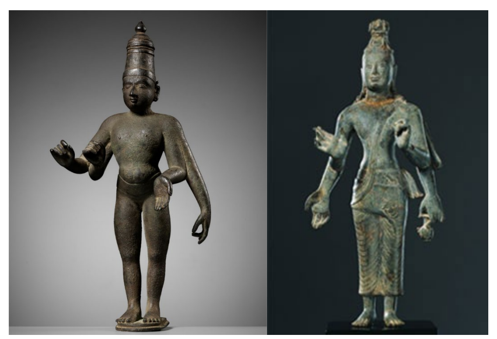
Fig 1. Lot 243 next to No. 1979.041 of the Asian Art Society, gift of John D. Rockefeller.

The current lot likely represents a hitherto unknown type of temple bronze dating to as early as the 11<sup>th</sup> century during the reign of the Chola. The iconography and casting techniques are suggestive of this South Indian origin, with influences also present from Southeast Asia.