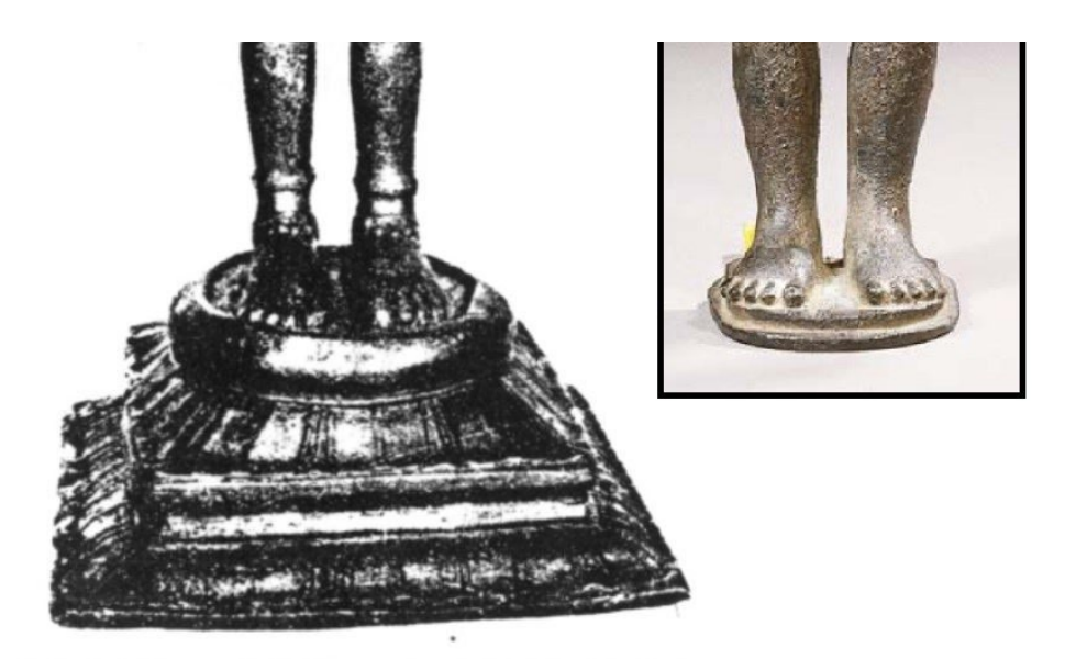
Fig 5. Comparison of the current lot with the base of a Chola bronze

Figure 4 shows the current lot positioned as an intermediary force between two well-defined styles present from at least the 8<sup>th</sup> century on, allowing one to see the extent of cross-cultural influence. The unfamiliar dress and implements have been discarded for the simple attire of the ascetic deities worshipped in Southeast Asia. In addition to these changes, we see an enhanced physical appearance. The purposeful integrity and strength of the bronze have been maintained while appealing to the foreign audience.