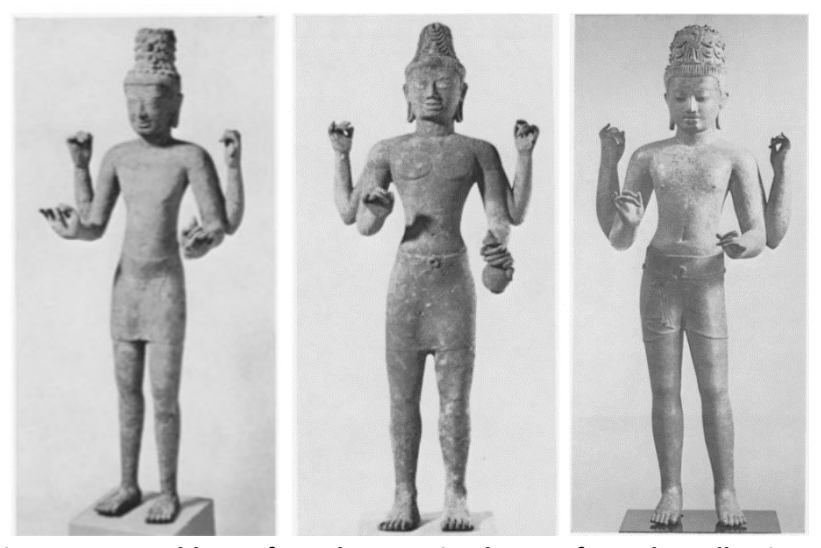
Fig 3. An assemblage of Southeast Asian bronze from the collections of Avery Brundage and John D. Rockefeller

Once Indian empires like the Chola expanded and settled throughout Southeast Asia, it is certain that they would've commissioned local artisans to assist with building new temples and casting new bronzes. These artisans would've been required to adapt their style and techniques to an unfamiliar set of Hindu iconographies, resulting in a new body of work with particularly unique nuances serving as an artistic bridge between two cultural styles.